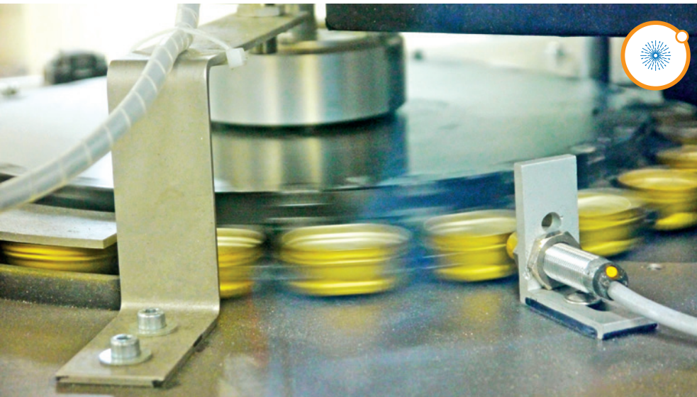
Continuous quality control with high-speed cameras

Given that we as a long-standing industry partner know just how crucial meeting the highest quality standards is for our customers, we have been working in accordance with the ISO 9001 DIN standard for 20 years. This entails, among other things, quality checks at our own test laboratory as well as using top-notch materials. We carry out sensory testing to ensure that the quality of flavour of the products is preserved for our customers, and we continuously examine our production process. Among others, cameras checking our closures for cleanliness, roundness, and other relevant parameters are a permanent feature in this. This way, our customers may rest assured that all the closures that we deliver meet the highest quality standards.